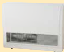
EX22C / EX22CW (EX22CW shown) (ideal output for mid to larger-sized areas)